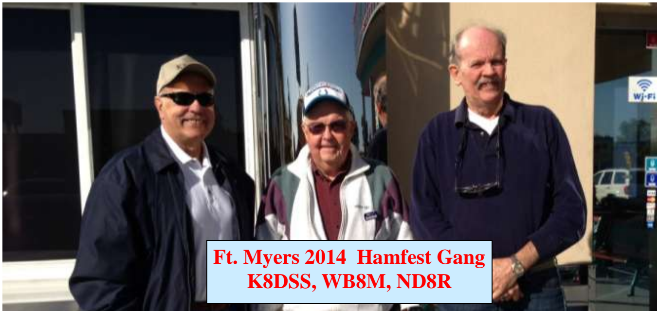
Ft. Myers 2014 Hamfest Gang K8DSS, WB8M, ND8R