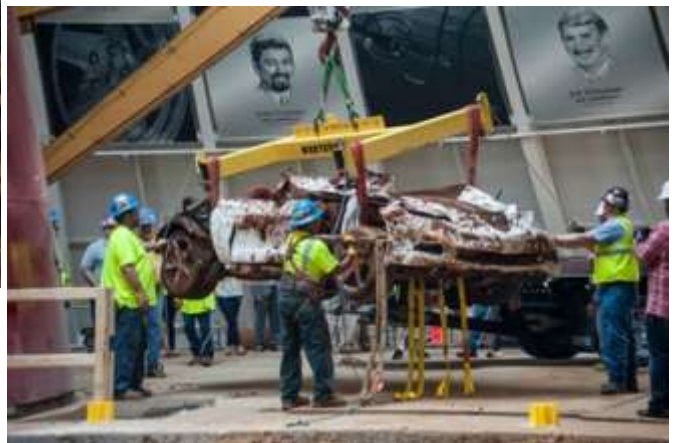
Here is the 7th one removed. The farther down the worse they got. 2009 Corvette, 1.5 Millionth one built.